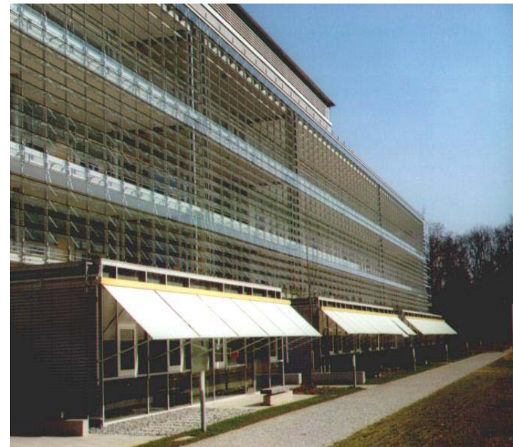
Hochschule Ingolstadt University of Applied Sciences

... applicant figures at an all-time high (> 6000 applicants for 750 places).